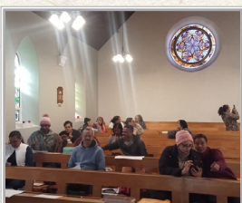
Page 7 Sunday School Quiet Day