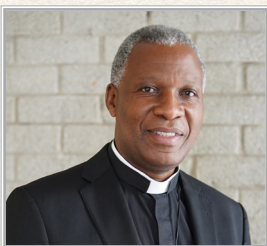
Page 6 Ad Laos July 2024