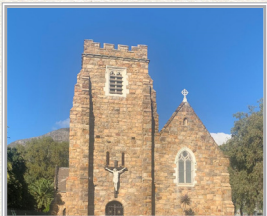
Page 3 St Mary's Woodstock celebrates 165th