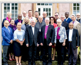
Page 4 ARCIC III held in Strasbourg, France