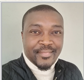
Page 5 New YPM Coordinator for the diocese