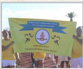
Page 7 130th celebration of the Brigade