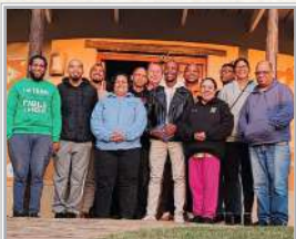
Page 4 FOV retreat at Christian Brothers Stellenbosch