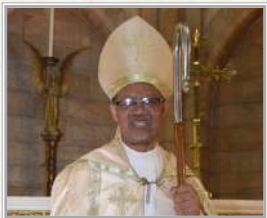
Page 3 From the Bishop's desk May 2024