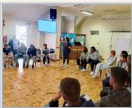
Page 5 Christ Church Constantia confirmation workshop