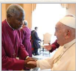
Page 6 May Ad Laos