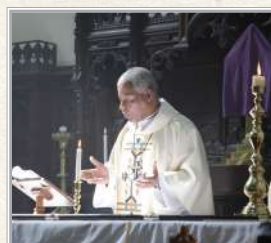
Page 6 April 2024 Ad Laos