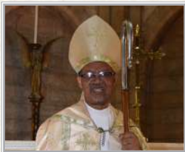
Page 3 From the Bishop's desk April 2024