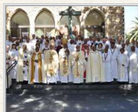
Page 5 Chrism Mass 2024 at St George's Cathedral