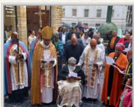
Page 4 The Dean of Cape Town retires