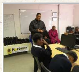
Page 7 School shoe donation to Hout Bay