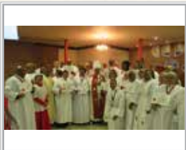
Page 4 Twenty-two layministers receive Preaching licence