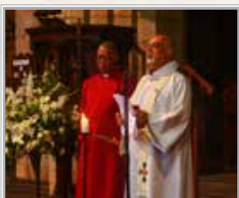
Page 7 Solidarity Vigil at St George's Cathedral