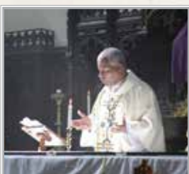
Page 6 October Ad Laos 2023