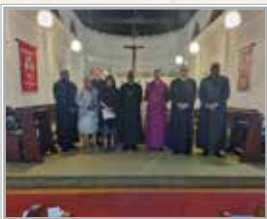
Page 5 Transitus service of the Third Order