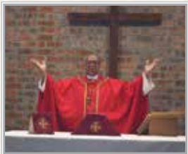
Page 3 From the Bishop's desk October 2023