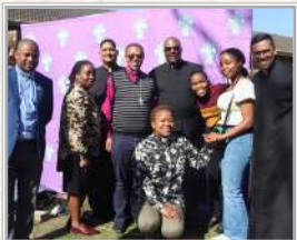
Page 2 CoTT celebrates its 30th anniversary