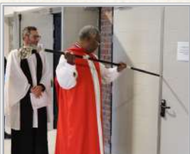
Page 4 Consecration of Life Centre at CHS