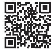
Scan QR code with your mobile and learn more about the Diocese of Cape Town