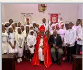
Page 7 Confirmation service at St Cyprian's Langa