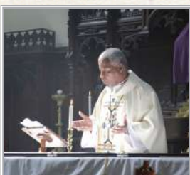
Page 6 August Ad Laos 2023