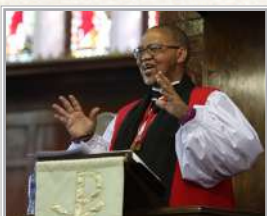
Page 3 From the Bishop's desk August 2023